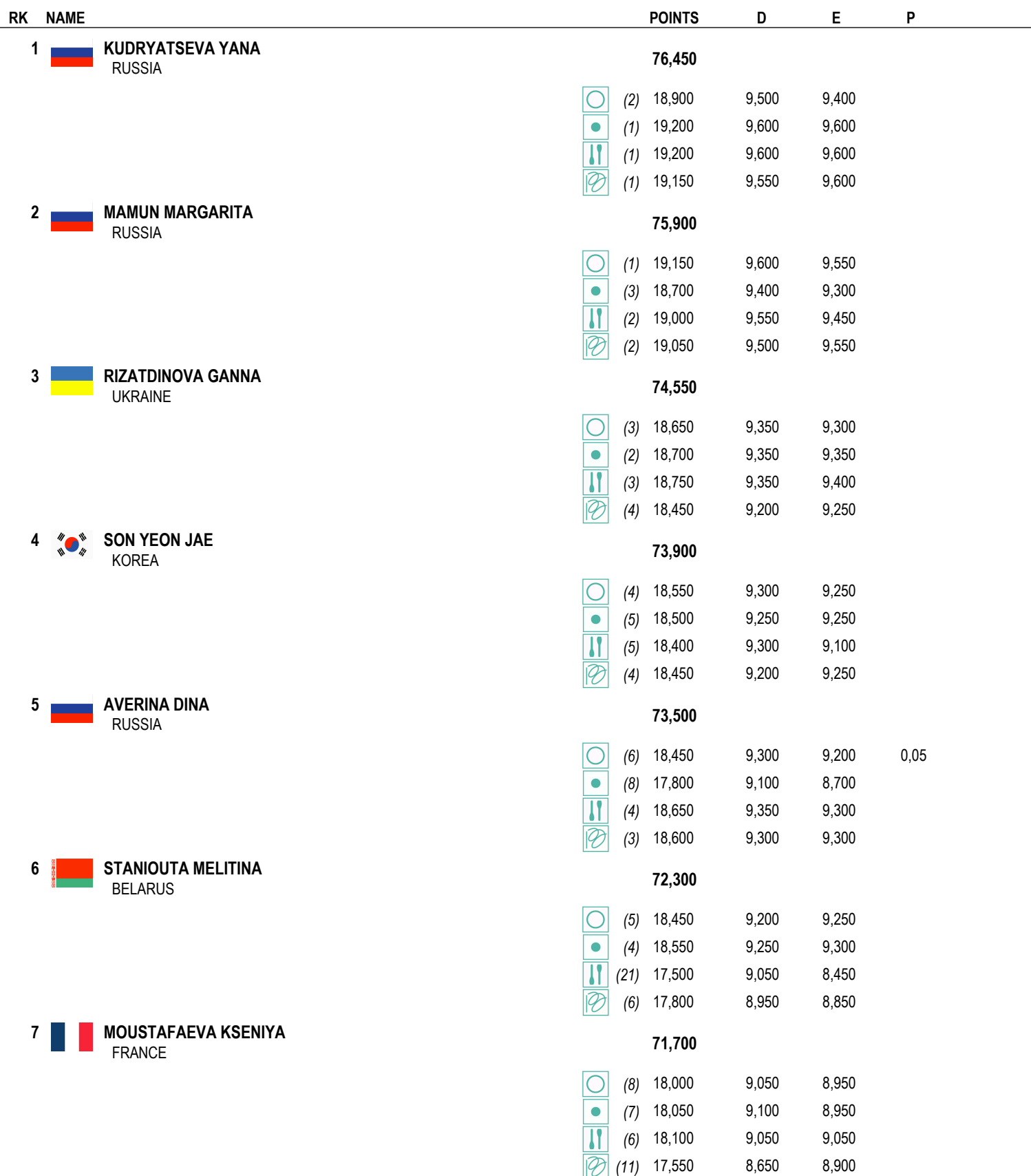
FIG RG WORLD CUP PESARO All around Individual - Qualifications for Finals